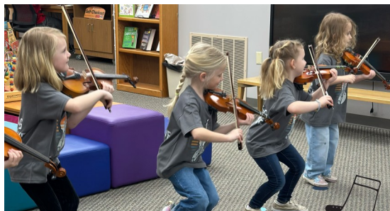
Another of the 2025 grant recipients was Tiny Strings of Wapakoneta , a project of Riverside Art Center. This is an amazing program that provides 15 weeks of beginner violin lessons for kids ages 4-7. The program also provides use of a violin. It received a $6,000 Community Fund Grant.

When the original Foundation Board met in 1989, it identified several objectives in its Mission Statement. One included "distribute grants for charitable purposes in the areas of health, economic development, basic human needs, education, cultural activities, environment, and community services." We believe it is appropriate to proudly say... MISSION ACCOMPLISHED! Thanks for your help in making it possible! Now is the time to make your contribution to the Annual Community Fund Campaign.