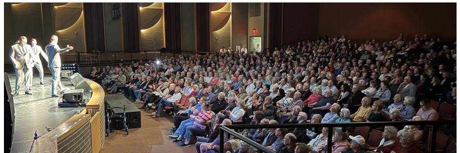
Performing Arts Center — Under the Streetlamp Concert — April 12, 2025

Our mission statement also includes, “Act as a catalyst in identifying and addressing community needs.” This is another example of the Foundation helping to improve the quality of life in the Wapakoneta area.